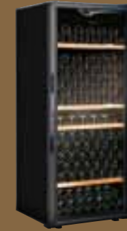
V166 - Nero Medium capacity 158 bottles - Glass door