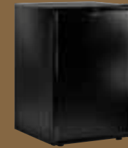
V101 - Nero Small capacity 100 bottles - Solid door