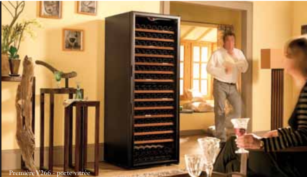
Première V266 - porte vitrée