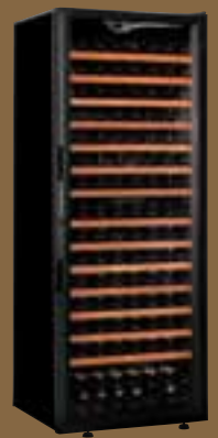
V266 - Nero Large capacity 170 bottles - Glass door