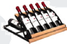
Articulated presentation kit: AOPRES (to be assembled on an ACMSC)