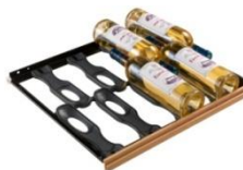
Sliding shelf ACMSC