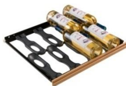
Sliding shelf ACMSC