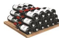
Storage shelf AXUH