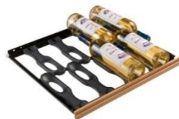
Sliding shelf ACMSC